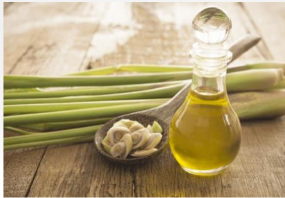
Lemongrass Essential Oil